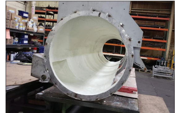
ARC MX FG coated mixer internals.

Client has initiated steps to add ARC coatings to future combi mixer repairs to their worldwide operations.