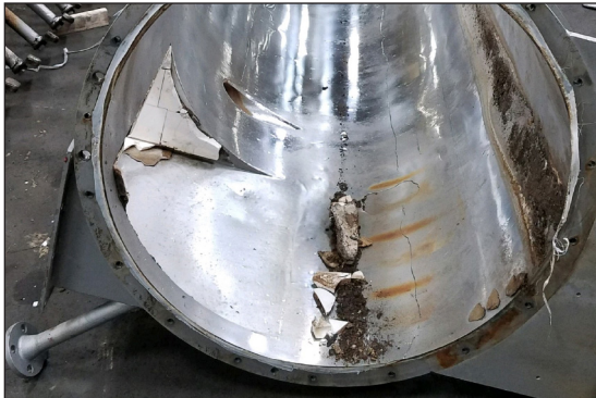
Signs of abrasive wear to internals of mixer.

Severe abrasion from corn milling residues used in animal feed processing result in severe abrasion to mixer internals.